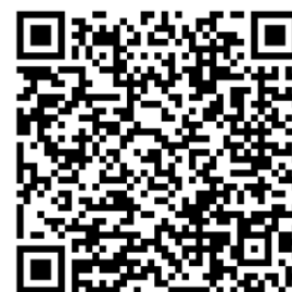
HEE Newly Qualified Pharmacist pathway webpage

The pathway is also intended to help pharmacists make the transition to more independent, self-directed learning. It acts as a stepping-stone towards enhanced and advanced practice.